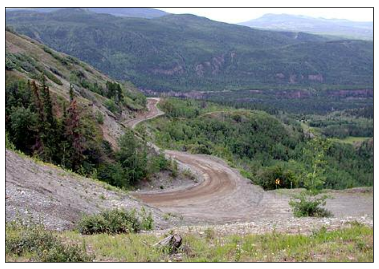
Telegraph Creek offered lots of exposure to go with the curves.