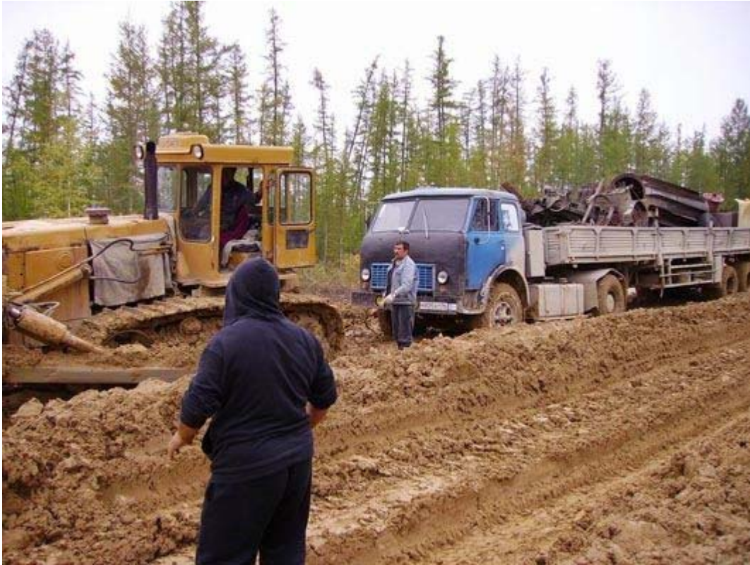
This is typical way to drive (Bulldozer+Truck)