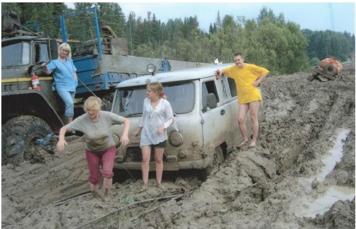
Blondie: Shit! We missed the turn! Where we can exit to Vegas?