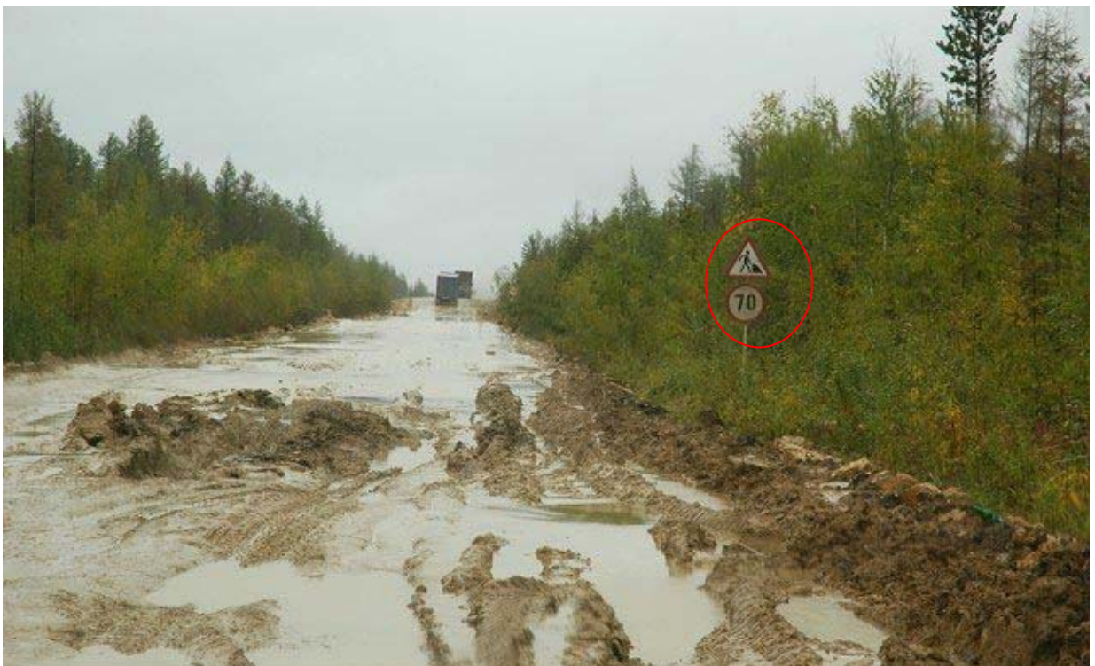
Some time we have to reduce the speed because of road repair work