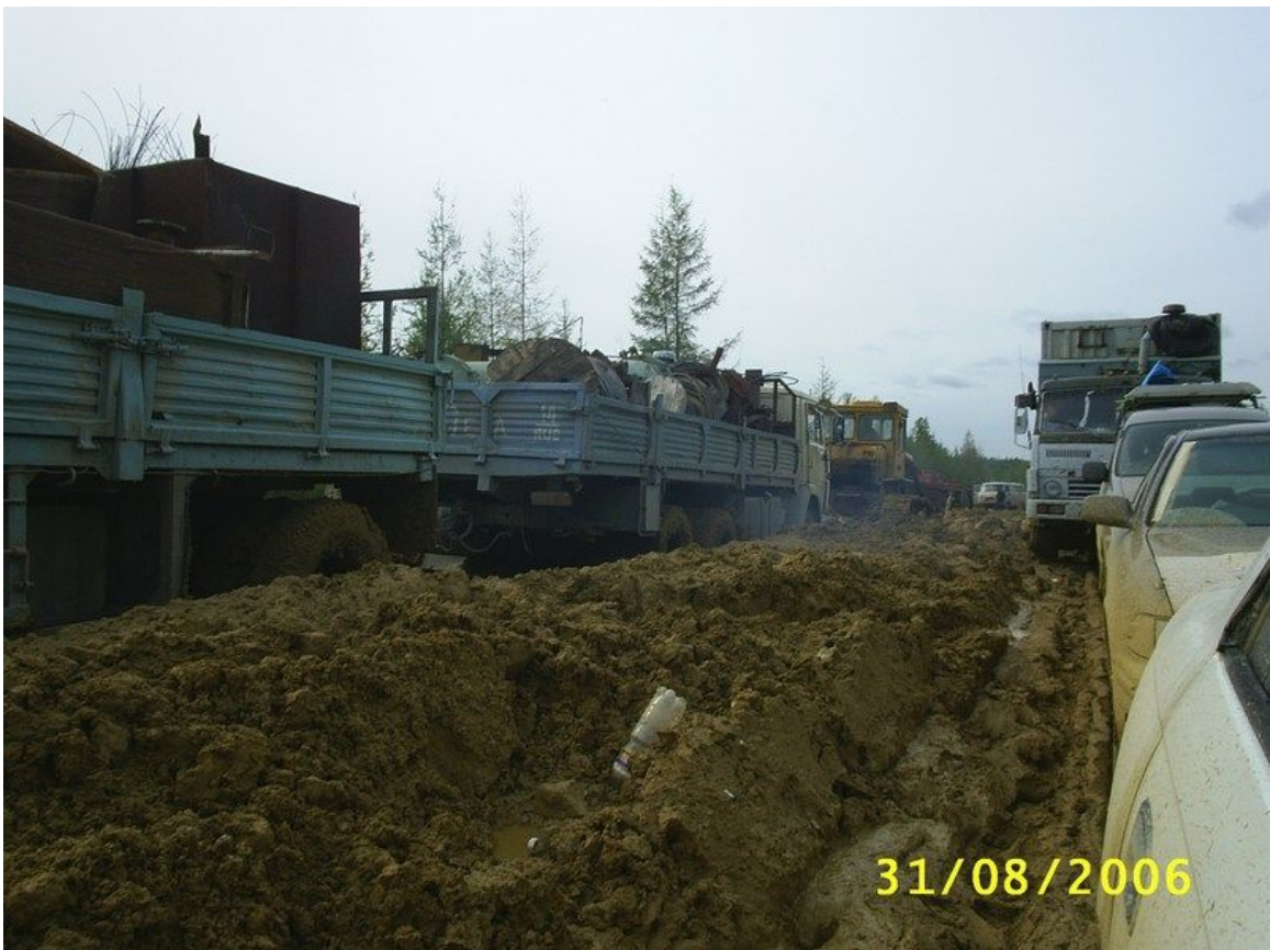
Rush hours 2