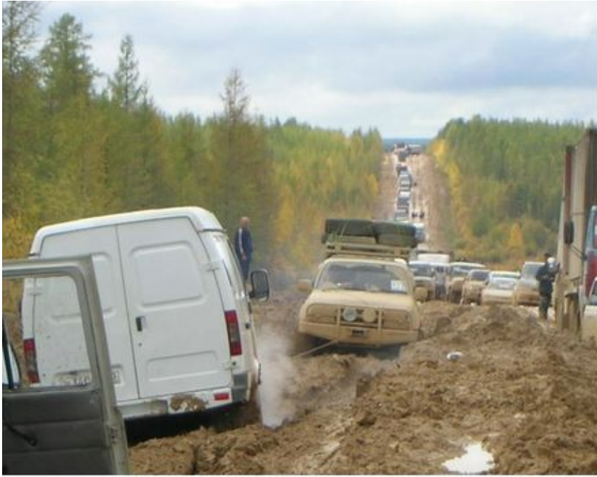
Waiting for the traffic light 600 cars in line