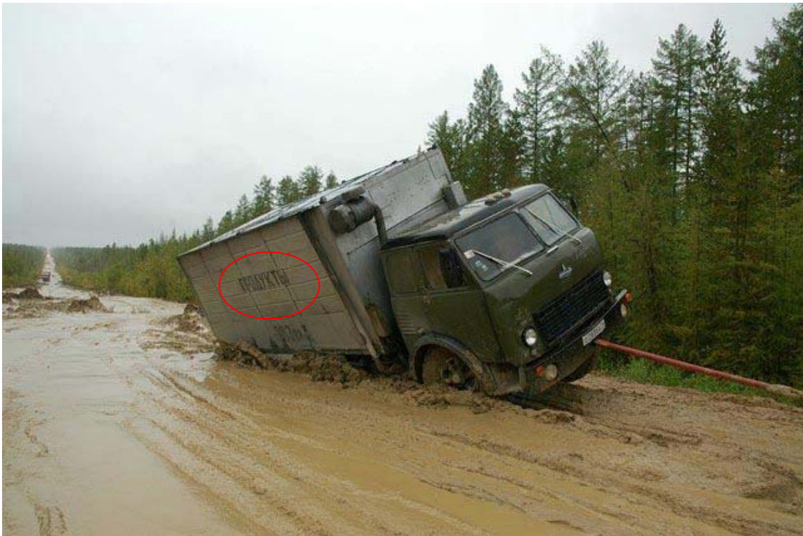
Foodstuff fast delivery