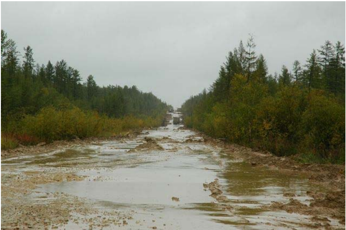
This is the FEDERAL road (and only one in this region) to big city Yakutsk from Nerungri